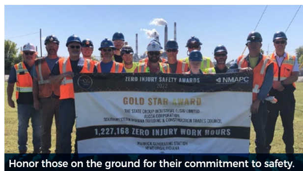
Honor those on the ground for their commitment to safety.

Hundreds of contractors, local unions, and owner clients have been present at ZISA® over the last two decades, representing the best of the best in construction and maintenance.