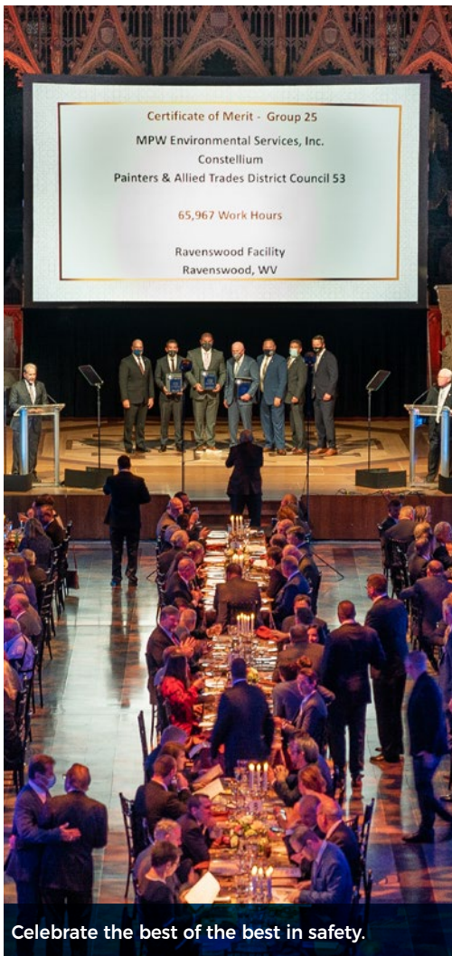
Celebrate the best of the best in safety.

– once thought to be impossible – are the direct result of the mutual cooperation, respect and willingness to collaborate that are found within the NMAPC and the union construction industry in general. The winners' hard work, cooperation and dedication to the zero injury philosophy prove once again that union construction and maintenance are the safest and best options on the market.